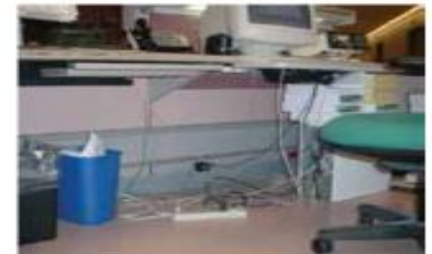
Cords at nurses station

Mount cords off the floor or underneath desks