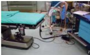
Cords in a procedural area